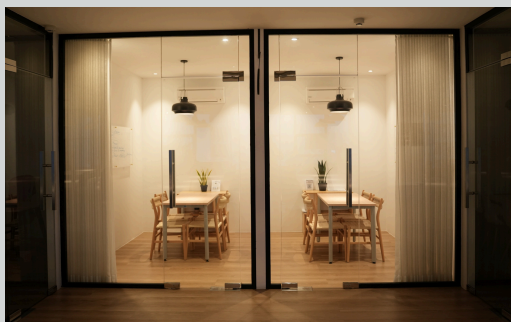
Kumnit ‘កំនិត’ Room and Kumnou ‘កំនូរ’ Room: Ideal for online (Zoom) meeting, private call or meetings with 2-4 people. Priority-based booking basis.