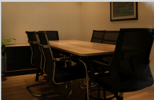
Sambok “សម្បត្តិ” Room: Designed to accommodate 4-6 person meeting. Priority-based booking basis.