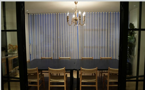
'Assembly' Room: Best for 6-10 person meeting purposes. Priority-based booking basis.